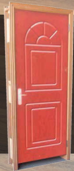
Coated MDF Door CL - 12

We take pride in creating locally manufactured wood products that utilizes sustainable wood processing technologies to minimize the use of endangered hardwoods. Our commitment to sustainable wood production is reflected in our ever-expanding forest plantations across Nakuru County and our on-going reforestation program partnership with the Government of Kenya.