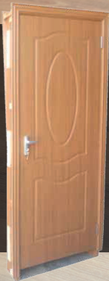
Coated MDF Door CL - 10