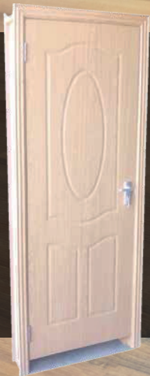
Coated MDF Door CL - 09

Welcome to our wide range of stylish MDF doors.