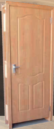
Coated MDF Door CL - 11